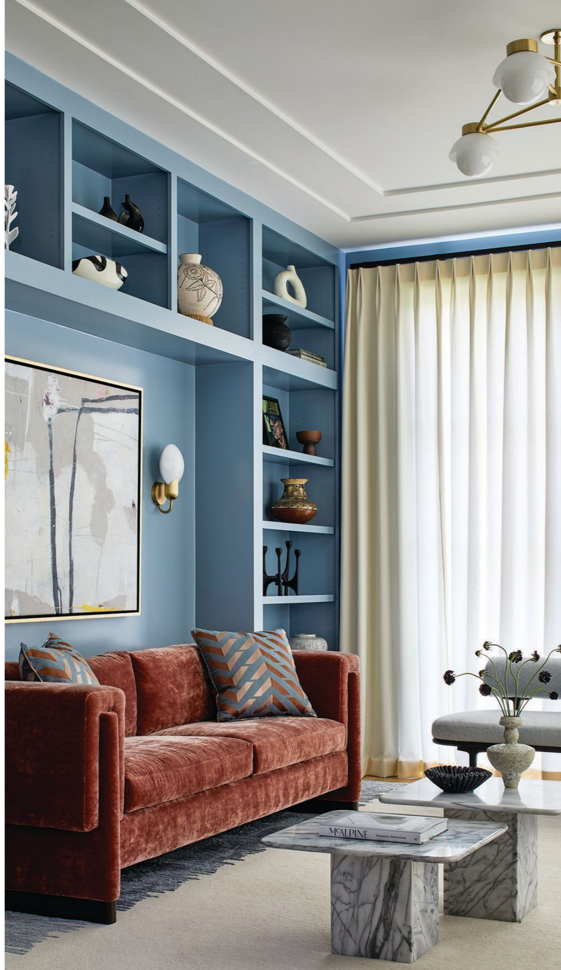
Winter Lake Blue from Benjamin Moore offers a vibrant yet soothing feel to the living room with drapery from Rockville Interiors: the open and bright family room.