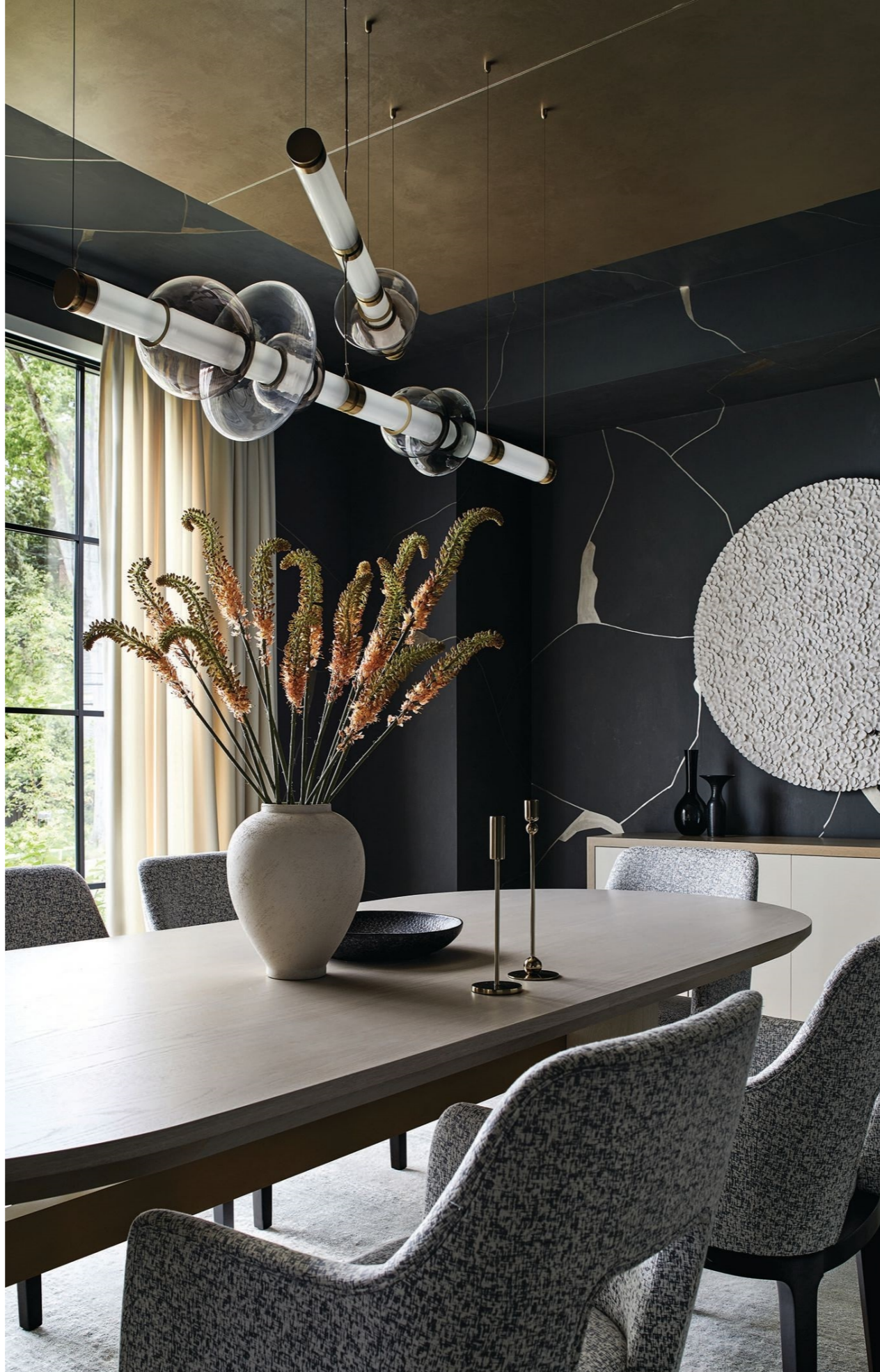
A racetrack table from Hellman-Chang and blown-glass chandelier from Gabriel Scott grace the dining room.