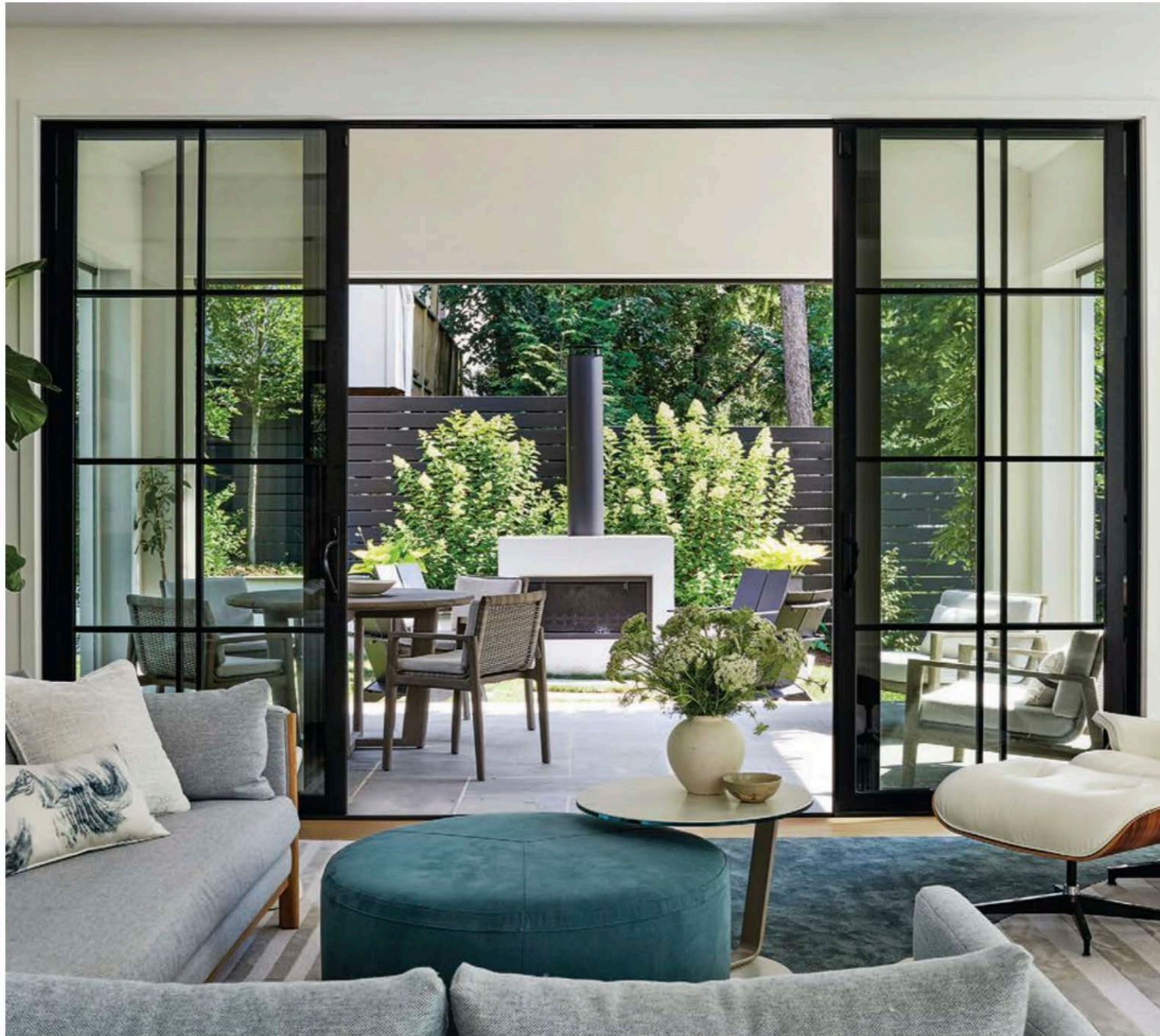
A transition between indoor and outdoor spaces is seamless

“The clients are avid readers, so a comfortable lounge chair with books in easy reach was also a must,” says Ebert, who used a console table from Lawson Fenning ( lawsonfenning.com ) with open shelving to double as a dressing table and book storage.