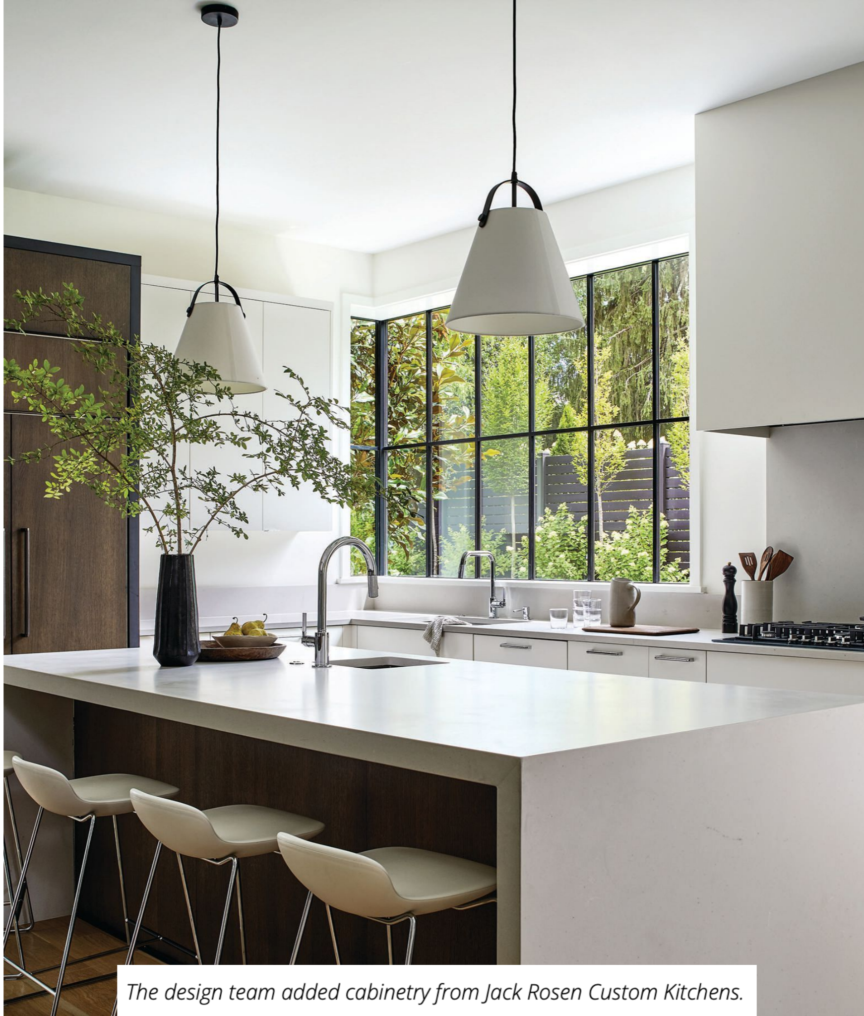
The design team added cabinetry from Jack Rosen Custom Kitchens.