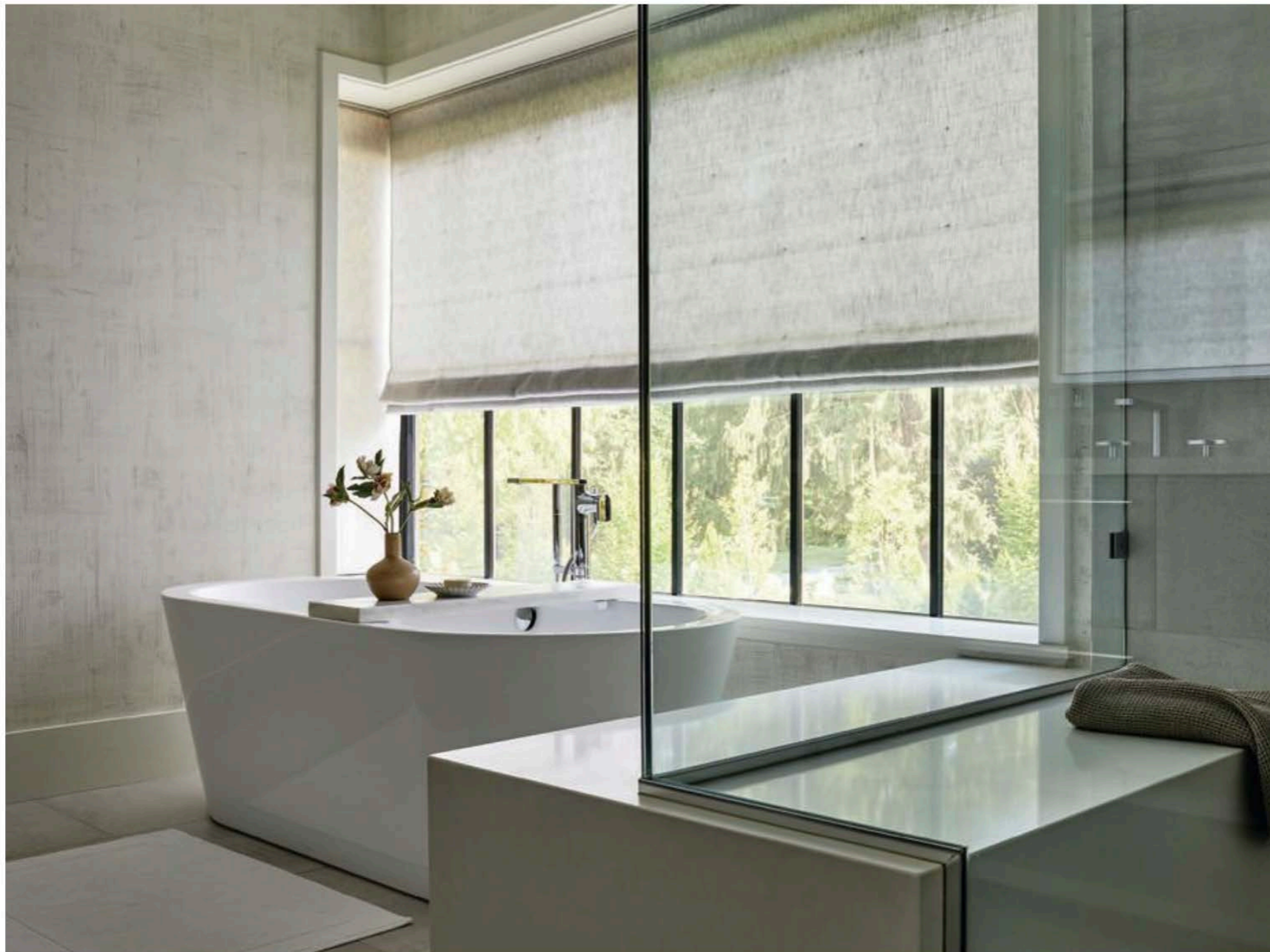
the primary bath offers a soothing escape.

“The windows are flush to the floor and facing the street, so functional curtains from Rockville Interiors with Mark Alexander were necessary,” says Ebert. “When they are drawn, this room is ready for the swankiest dinner parties.”